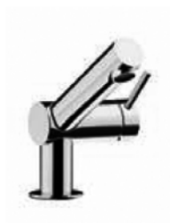
1. COSMIC sink faucet model CONTROL