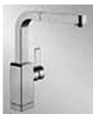
9. tap BLANCO ref: blancolevos-s cromado