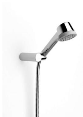
2. ROCA shower faucet model TARGA