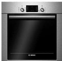
1. oven BOSCH ref: HBB 43C450E