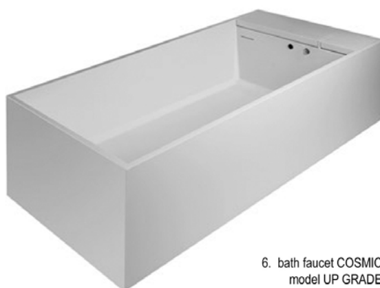
6. bath faucet COSMIC model UP GRADE

Pare Claret, 22, 3a · 17001 GIRONA T. 972 463 644 · F. 872 08 04 02 info@sifera.es