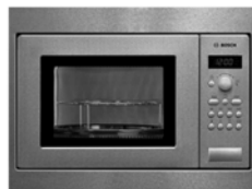
2. microwave BOSCH ref: HMT 75G 651