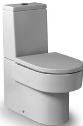
5. WC ROCA model HAPPENING