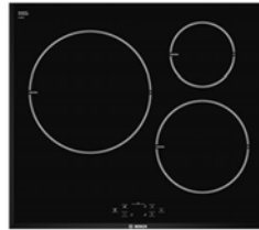
3. induction hob BOSCH ref: PIL 651 R14E