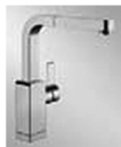
9. tap BLANCO ref: blancolevos-s cromado