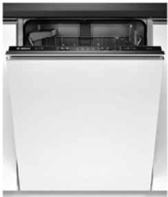
4. integrated dishwasher BOSCH ref: SBV 50E00 EU