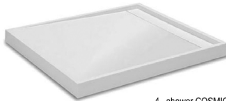
4. shower COSMIC model COMPACT