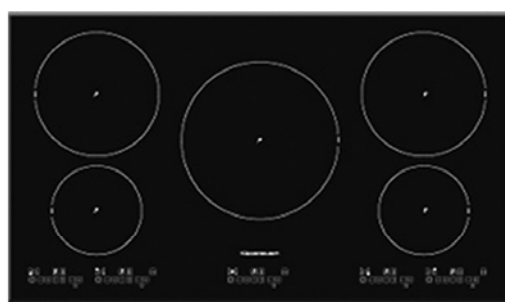
2. 90 cm induction hob KUPPERBÜSCH ref: EKI 957.1