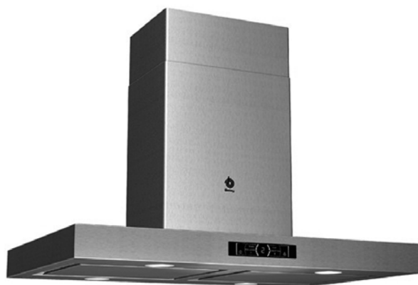
10. kitchen hood Balay ref: 3BI898

Pare Claret, 22, 3a · 17001 GIRONA T. 972 463 644 · F. 872 08 04 02 info@sifera.es