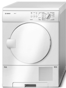
5. dryer BOSCH ref: WTC84000EE