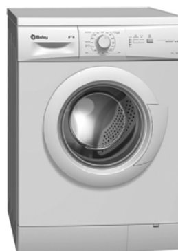
6. washing machine BALAY ref: 3TS60100EE