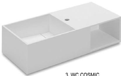
3. WC COSMIC model COMPACT