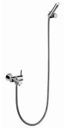
2. COSMIC shower faucet model CONTROL