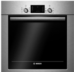
1. oven BOSCH ref: HBB 43C450E