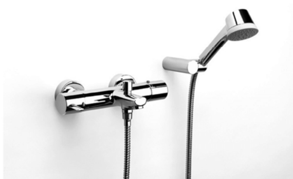
6. ROCA bathtub faucet model TARGA