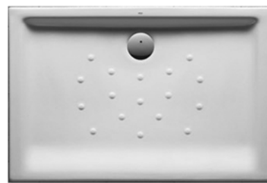
5. shower ROCA model MALTA