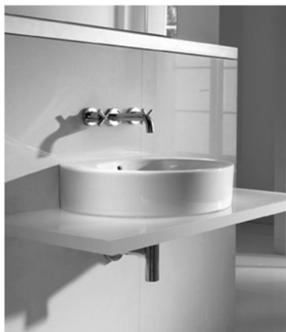
2. WC ROCA model HAPPENING