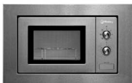
2. microwave BALAY ref: 3BI898