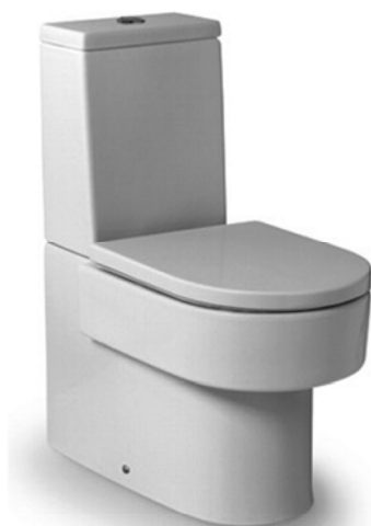
1. toilet ROCA model HAPPENING