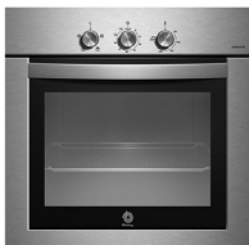
1. oven BALAY ref: 3HB508X