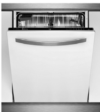
4. integrated dishwasher BALAY ref: 3VF342NP