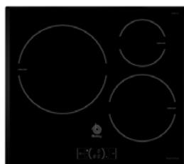
3. induction hob BALAY ref: 3EB815L