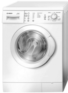
6. washing machine BOSCH ref: WAE20164EP