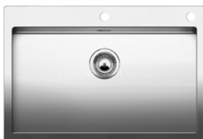
8. sink BLANCO ref: blancoclaron 700 be