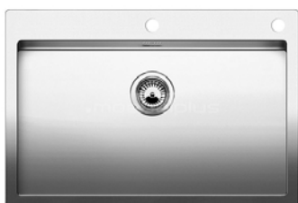
8. sink BLANCO ref: blancoclaron 700 be