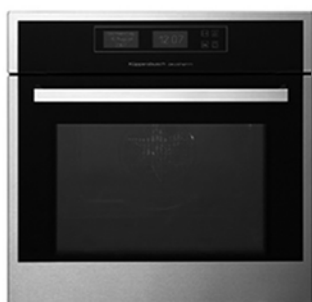
1. oven KUPPERBÜSCH ref: EEB6600.5 MX