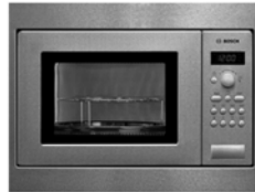
2. microwave BOSCH ref: HMT 75G 651