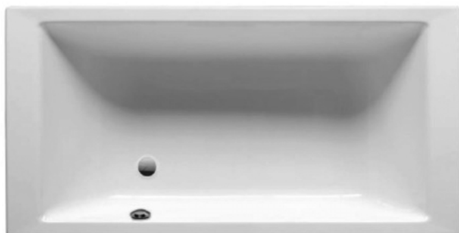
7. bath ROCA model VYTHOS

Pare Claret, 22, 3a · 17001 GIRONA T. 972 463 644 · F. 872 08 04 02 info@sifera.es