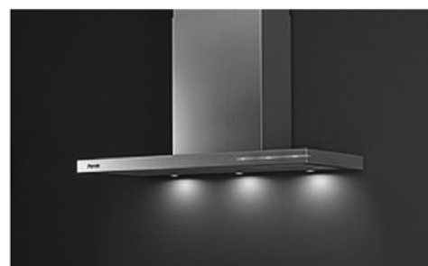
9. kitchen hood PANDO ref: P401 120cm V1150 SEC SYSTEM 1784

Pare Claret, 22, 3a · 17001 GIRONA T. 972 463 644 · F. 872 08 04 02 info@sifera.es