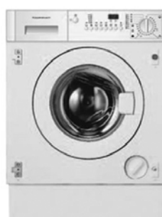
5. washing-dryer machine KUPPERBÜSCH ref: IWT 1459.1