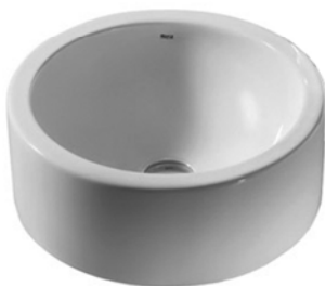
3. WC ROCA model TERRA