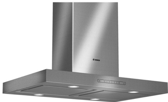
10. kitchen hood BOSCH ref: DIB099950

Pare Claret, 22, 3a · 17001 GIRONA T. 972 463 644 · F. 872 08 04 02 info@sifera.es