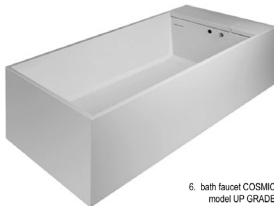
6. bath faucet COSMIC model UP GRADE

Pare Claret, 22, 3a · 17001 GIRONA T. 972 463 644 · F. 872 08 04 02 info@sifera.es