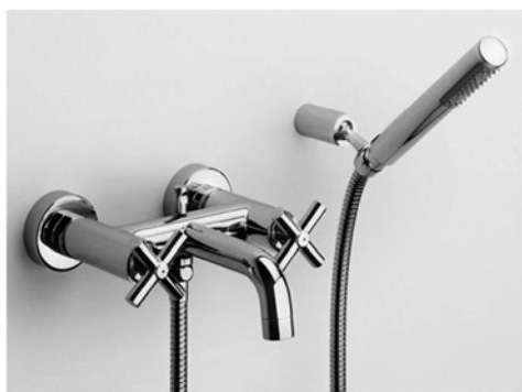
6. bathtub faucet ROCA model LOFT