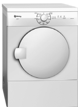
5. dryer BALAY ref: 3SE60100EE