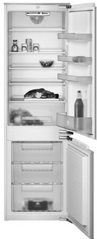
7. combined integrated fridge BALAY ref: 3KIB4851