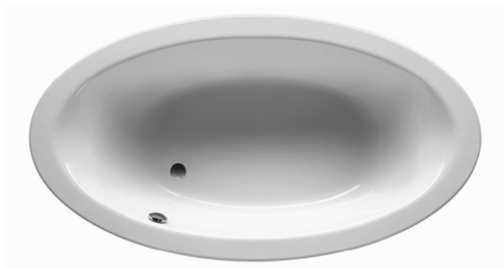
7. bath ROCA model GEORGIA

Pare Claret, 22, 3a · 17001 GIRONA T. 972 463 644 · F. 872 08 04 02 info@sifera.es