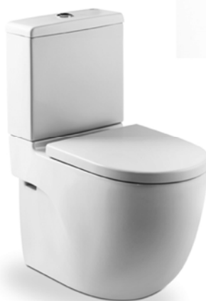
4. WC ROCA model MERIDIAN