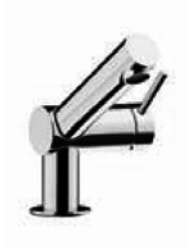
1. COSMIC sink faucet model CONTROL