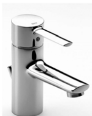
1. ROCA sink faucet model TARGA