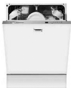
4. dishwasher KUPPERBÜSCH ref: IGV 6507.1