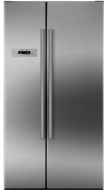
7. fridge side by side BOSCH ref: KAN 56V40