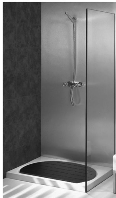
4. shower column ROCA model LOFT