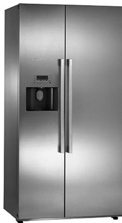
6. fridge side by side KÜPPERBUSCH ref: KE 590-1-2-T