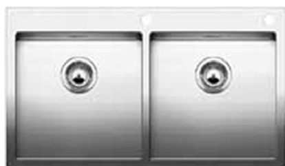
7. sink BLANCO ref: blancoclaron 400 be