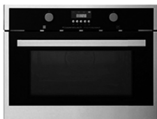
3. microwave KUPPERBÜSCH ref: EMWG 103.0E